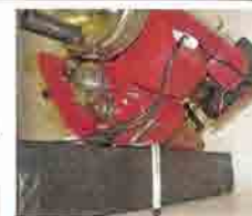
Kickstand in place.

Supports the Ultrafeed machine when hinged back in its portable case. Keeps the case from toppling over. Can be used on any Ultrafeed sewing machine in the Deluxe Case. Snaps on and off.