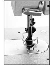
Unison feed assures even feed when sewing multiple layers

* Depends on thread, material & type of operation