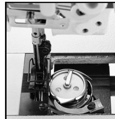
Large bobbin for greater production with fewer interruptions