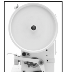
Extra large hand wheel increases torque