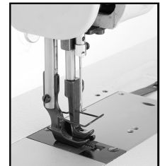
Unison feed assures even feed when sewing multiple layers